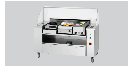
▶ Designed for KST Eco cooking station