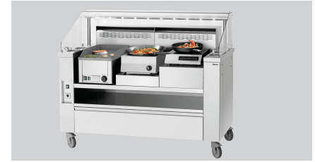
▶ Designed for KST Plus cooking stations